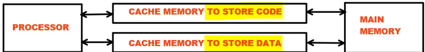
Split cache organization